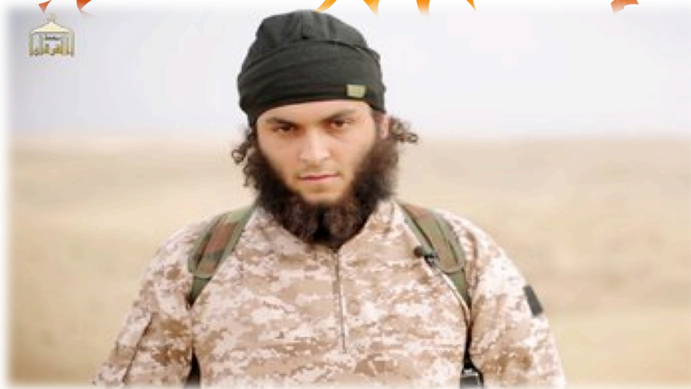
ISIS member from France

ISIS is a terrorist group from Syria and Iraq of the Middle East. They have been taking credit for beheading an American journalist. The United States police departments have been looking for any proof, since mid September. And trying to plan possible bombs in major cities. For example New York State.