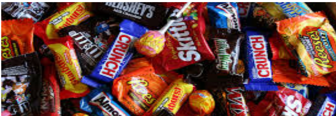
Common Halloween candy found in children's trick or treat bags

The fun filled day full of tricks, treats and fun costumes called Halloween. Every year on October 31 st kids participate by dressing up on Halloween while parents hand out candy to young trick-or-treaters. Halloween is commonly celebrated by children who dress in costume and collect candy or other treats door-to-door, but should Halloween be a national holiday? The significant decision leaves many torn.